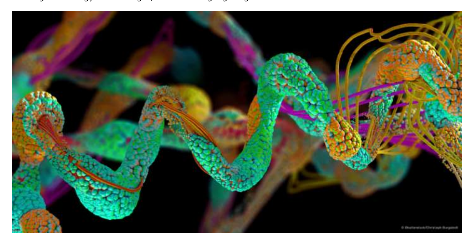
Figure 2 - Structure of amino acids constructed into protein chains

Most greenkeepers and agronomists reported they had some knowledge of the role of amino acids in building turf energy and strength, with 99% highlighting their interest to find out more.