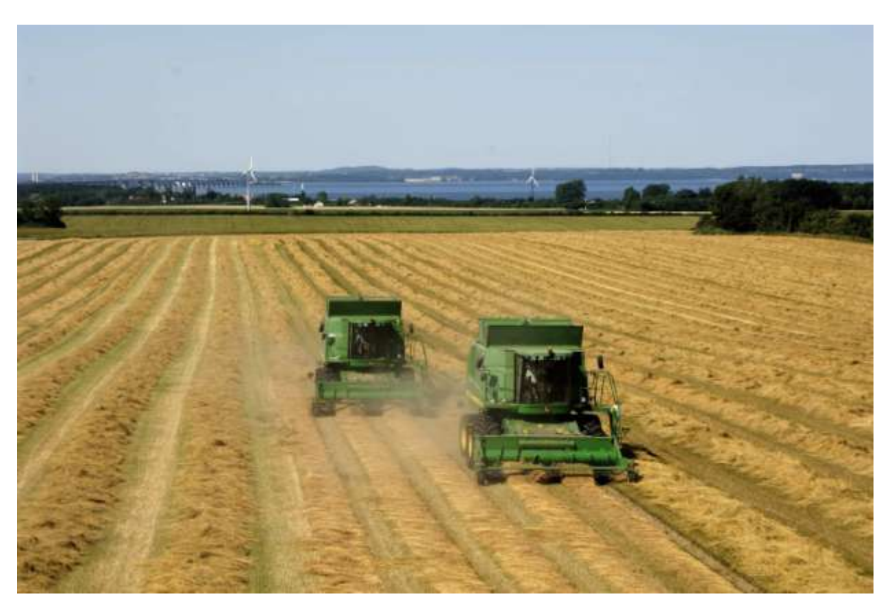
HARVEST: Close-to-average yields in Denmark, but a poor yield across the rest of Europe

For most turf producers 2020 has been a year of ups and downs, Covid-19 has created as many opportunities commercially as it has challenges. With many turf producers reporting strong sales, thoughts are now turning towards 2021 sowings and seed availability.