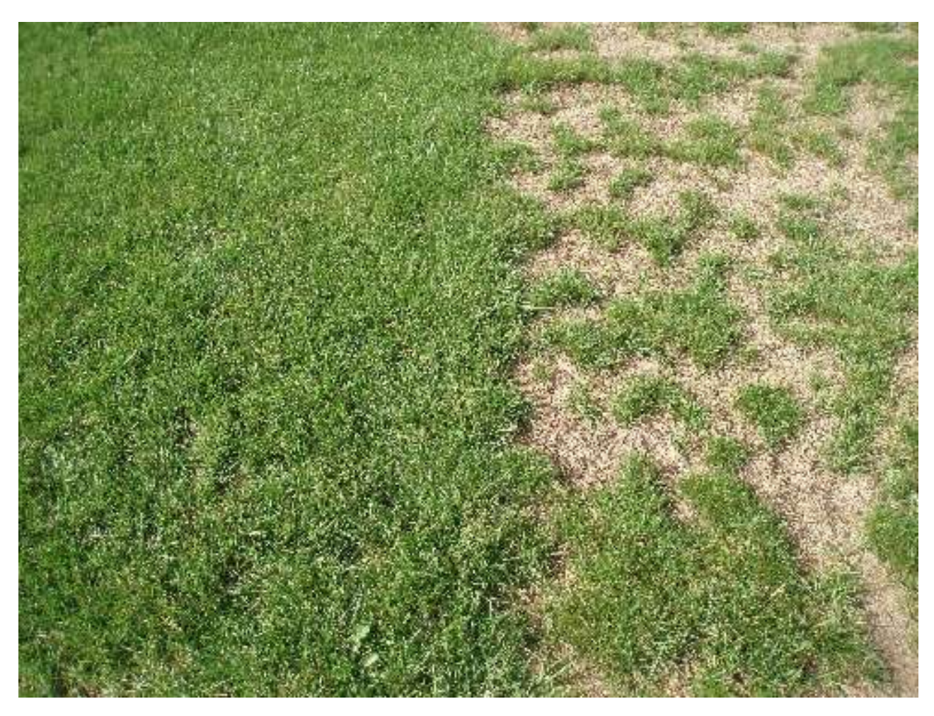
Figure 1: Drought stress trial Eurogreen GmbH

Approximately, the project period is scheduled between spring 2021 and at least until summer/autumn 2023.