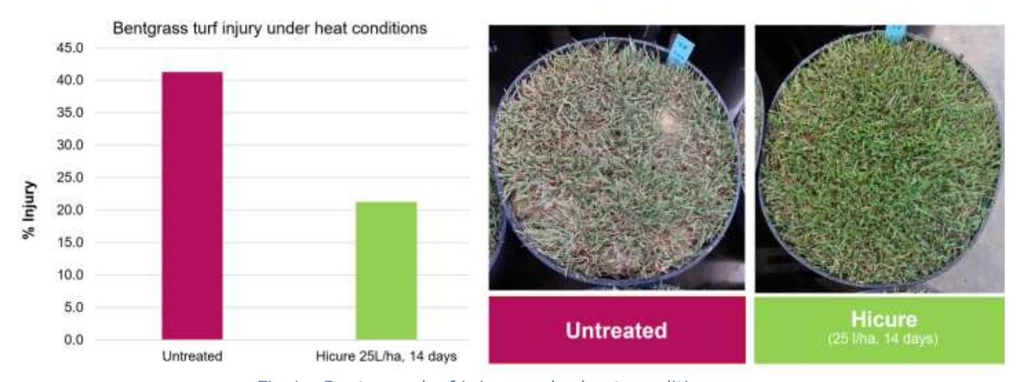
Fig 1 - Bentgrass leaf injury under heat conditions

For turf species, or particularly varieties, evolved and selected to perform in relatively cool and lower light European conditions, for example, they could be ill-prepared for changing climatic situations. Biostimulants could be crucial in helping those varieties better cope with challenges.