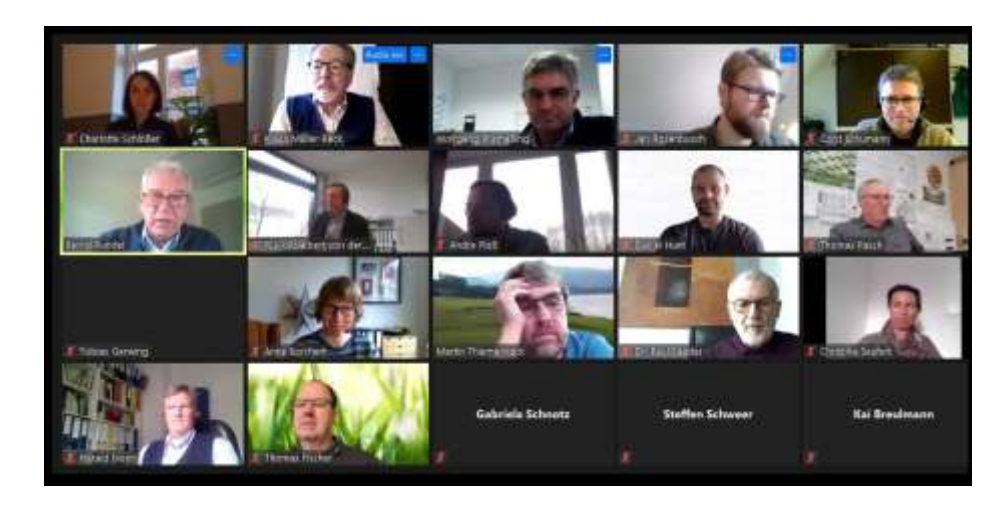
Fig.1: Zoom meeting of the participants of the advisory board for the endowed chair for turfgrass at HS-OS.

The subject "Applied Turfgrass Science" (Sustainable Turfgrass Science) is part of the Master's program "Applied Animal and Plant Sciences M.Sc." as one of five major fields of study are offered (HS-OS, 2020).